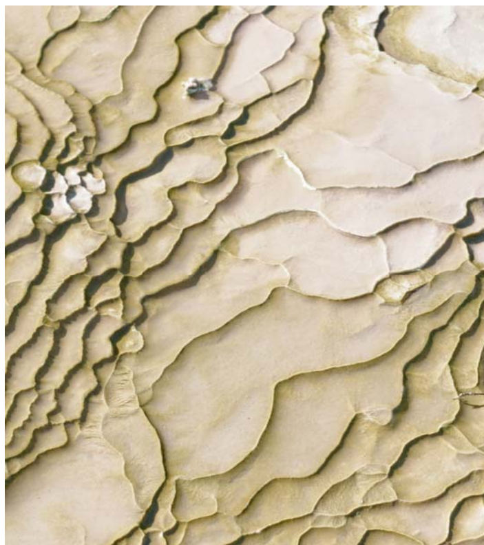
Image: Water eroding rocks, Waiotapu Thermal Area, Rotorua, NZ.