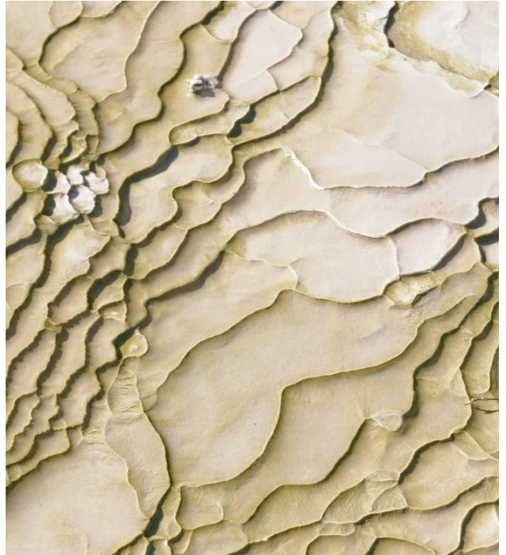
Image: Water eroding rocks, Waiotapu Thermal Area, Rotorua, NZ.