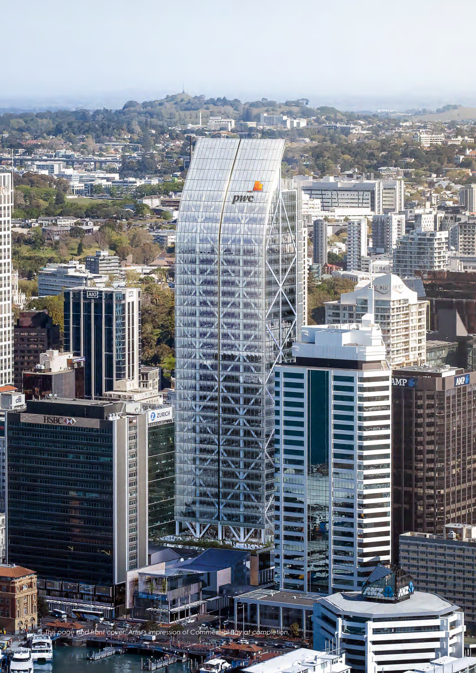
This page and front cover: Artist's impression of Commercial Bay at completion.