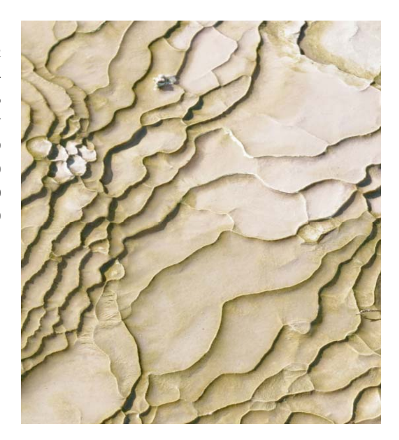
\textbf{Image:} \ \textbf{Water eroding rocks, Waiotapu Thermal Area, Rotorua, NZ.}