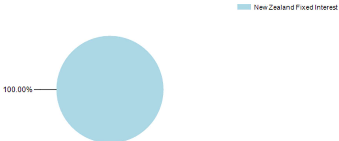
Target Investment Mix

'New Zealand fixed interest' may include international fixed interest.