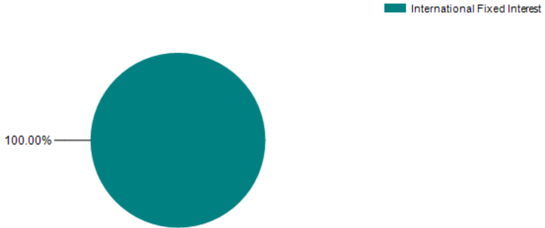
Target Asset Mix

Other includes forward currency contracts.