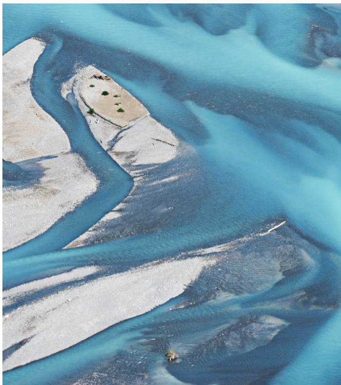
Image: Abstract aerial view of river bed, Canterbury Plains, Christchurch, NZ.