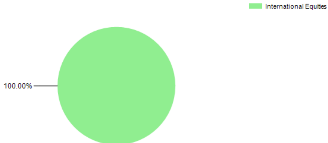
Target Investment Mix

'International equities' may include Australasian equities and listed property.